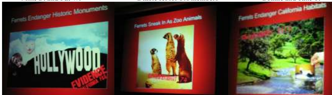
Bob Church's "Undercover DFG" series of slides - He's a loon!